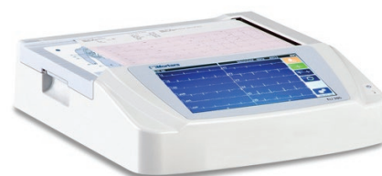
ELI™ 280 ECG

Contact your Welch Allyn representative to purchase, then visit www.welchallyn.com/ECGSpringPromo19 to redeem this rebate offer.