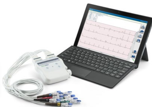
Connex® Cardio ECG