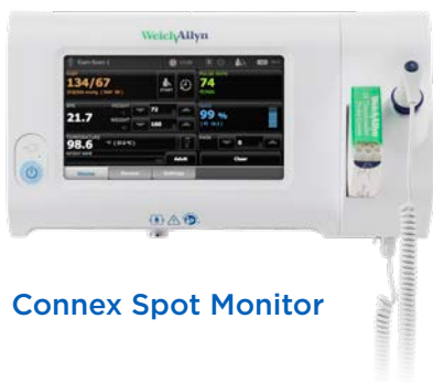
Connex Spot Monitor