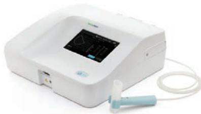
CP 150 TM ECG (with or without spirometry)