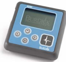
Burdick Vision Premier Holter System and 4250 Holter Recorders

For a limited time, when you upgrade your current Burdick® Vision Premier Holter System and 4250 Holter Recorders* to the Welch Allyn Vision Express Holter Analysis System and H3+™ Holter Recorders,** you will receive: