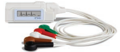
Vision Express Holter Analysis System and H3+ Holter Recorders