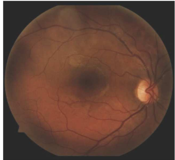
Diagnosis for Right Eye (OD): QA Scm·e = 98 NPDR Mild/Minimal- CSME