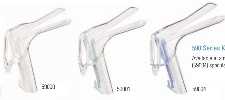
590 Series KleenSpec® Vaginal Speculum Available in small (59000), medium (59001) and large (59004) specula