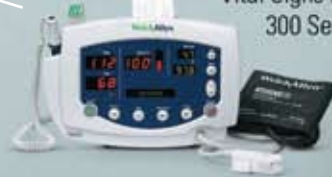
Welch Allyn Vital Signs Monitor 300 Series