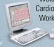
Welch Allyn CardioPerfect™ Workstation

AUTOMATIC 2-WAY TRANSFER PATIENT INFORMATION AND TEST DATA