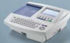
Welch Allyn CP 100™ and CP 200™ Electrocardiographs