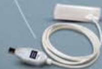
Welch Allyn PC-Based Spirometry