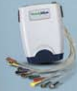
Welch Allyn PC-Based Resting ECG