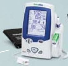
Welch Allyn Spot Vital Signs® LXi