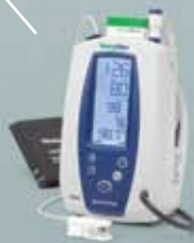
Welch Allyn Spot Vital Signs®