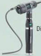
Welch Allyn Digital MacroView™ Otoscope