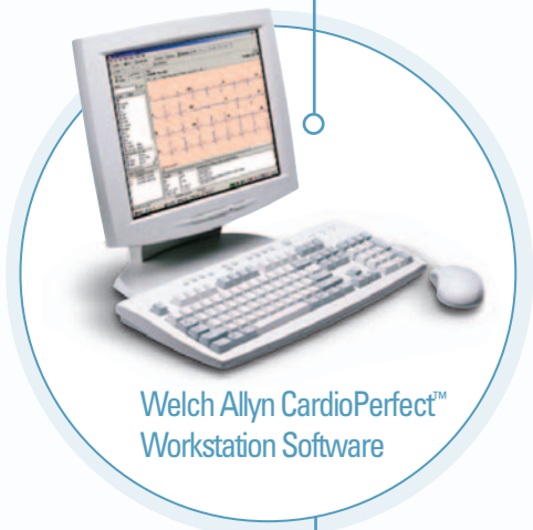
Welch Allyn CardioPerfect™ Workstation Software