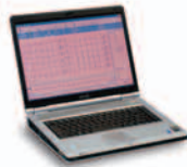
PC-based Resting ECG